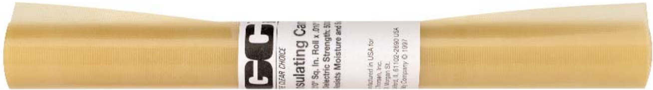
Fig. 2 Note: 210 sq. in. (9 in. wide) • Dielectric Strength 5,000 V