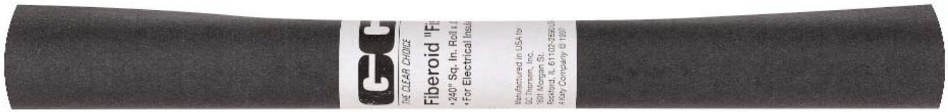
Fig. 1 Note: 0.01" ±10% Thickness